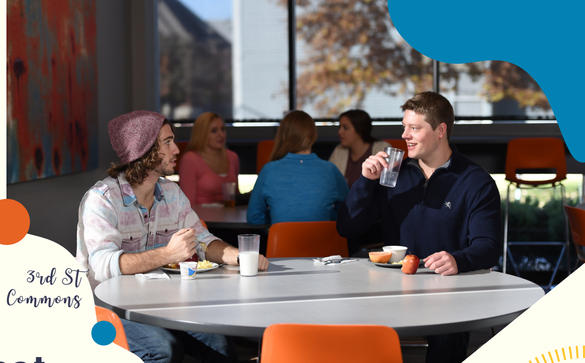
3rd St Commons